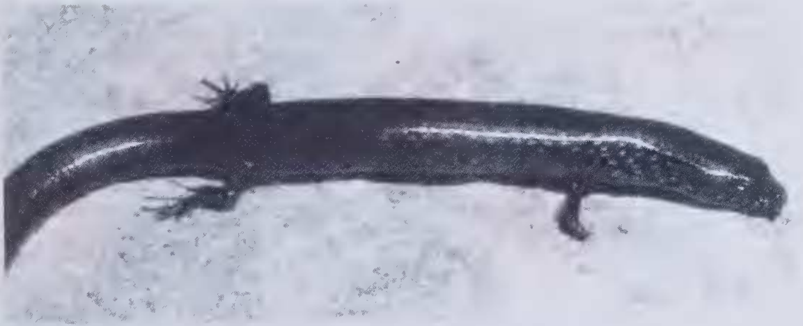
Figure 2 Holotype of G. butlerorum photographed in life by N.A. Cooper.

hind limbs 19.6-24.0% of SVL. It further differs from syntopic G. emigrans in its relatively shorter fore-limbs (15.2-18% of SVL v. >20%), lower subdigital lamellar counts (15-17 v. 18-21 on pedal digit IV; 8-9 v. 11-12 on manal digit III), and usually lower supraciliary count (6-7 v. 7-9).